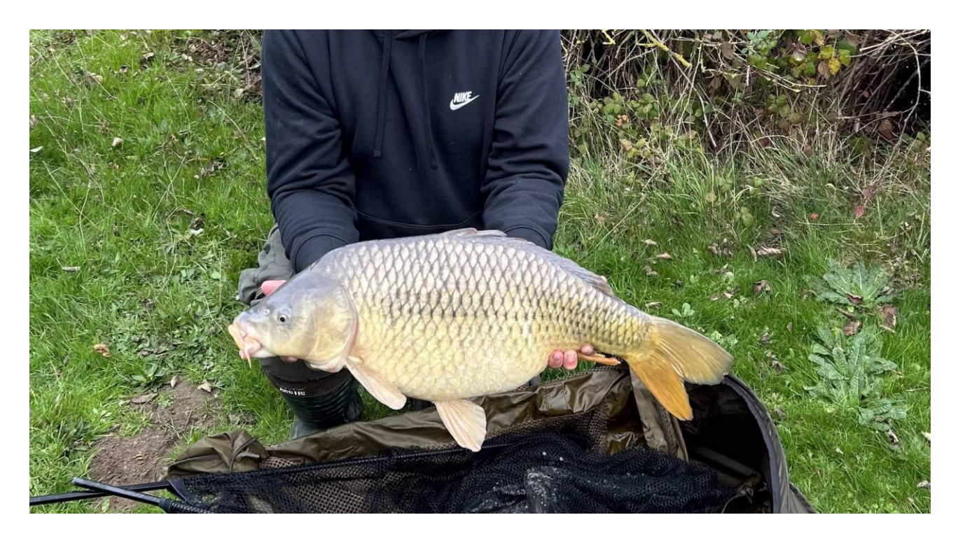
A shy angler with a 17lb carp at Shepherds Port.

It's got to be worth a few hours of effort when there is a chance of quality fish. Carp and chub on Shepherds. Bream on Kings. Bear Lake for carp and roach during the last week.